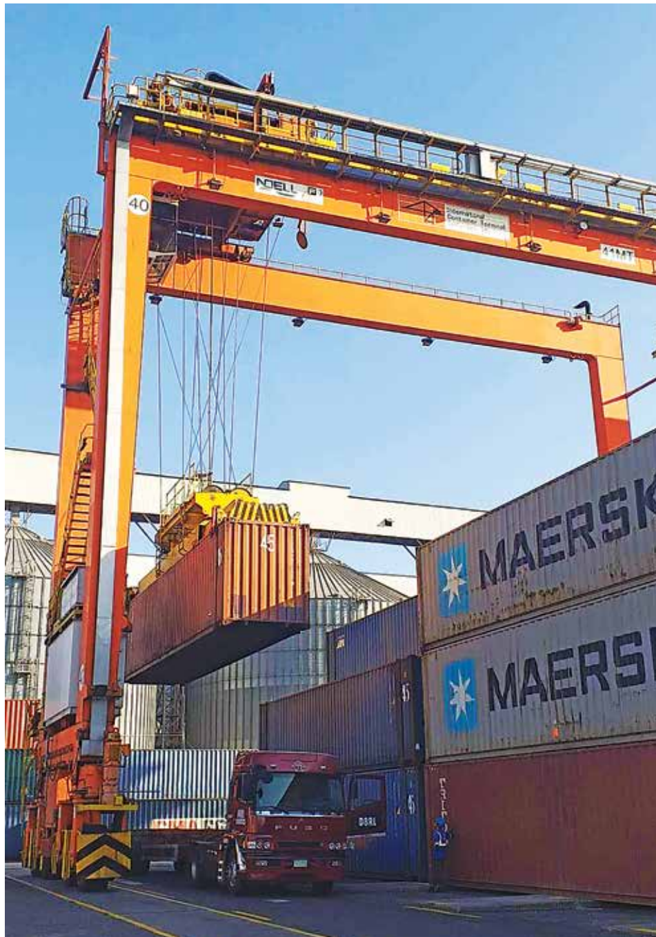
The addition of six RTGs to SBIT's yard equipment fleet has resulted in increased productivity and better overall operational efficiency.

Subic Freeport is the gateway to northern and central Luzon, serving the free ports and special economic zones in Subic and Clark, and the hinterlands of Bulacan, Pampanga, Bataan, Tarlac, and La Union.