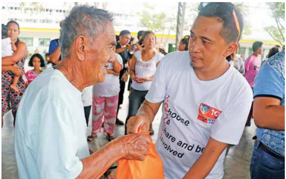
An elderly receives a pack of relief goods.