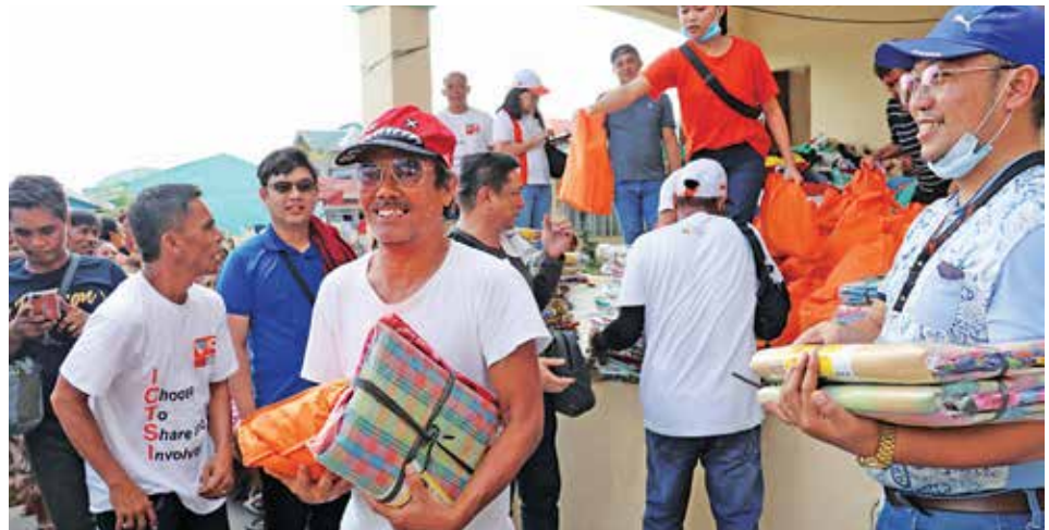
Aside from food packs, sleeping mats were also distributed to evacuees.