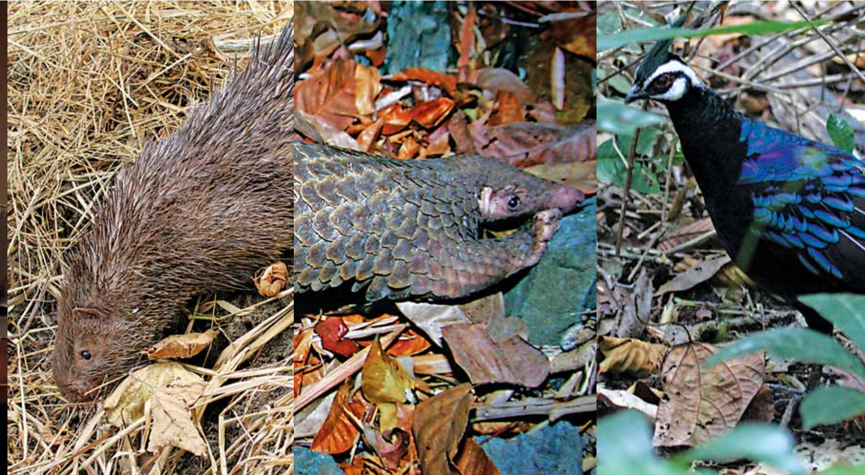
Endangered (from left): The Palawan Porcupine ( Hystrix pumila), the Philippine Pangolin ( Manis culionensis), and the Palawan Peacock-Pheasant ( Polyplectron napoleonis) are some of the target species of the ICTSI and Katala Foundations' joint wildlife conservation initiative.