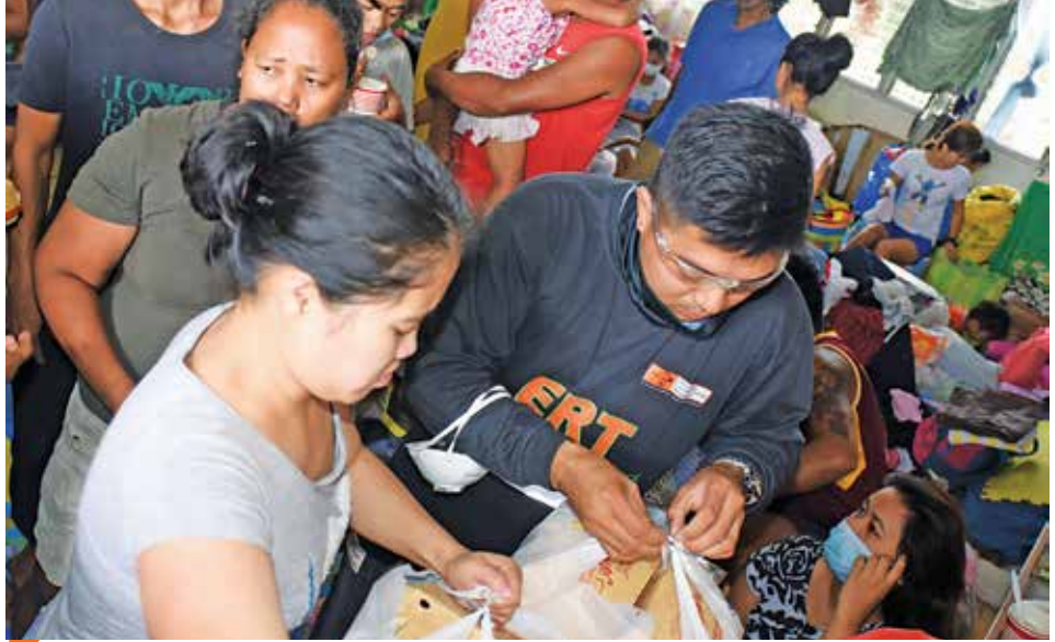
A volunteer from ICTSI's Emergency Response Team helps distribute food packs to evacuees in Sto. Tomas, Batangas.